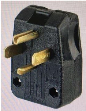
220/30 Amp Outlet. Requires this connection.